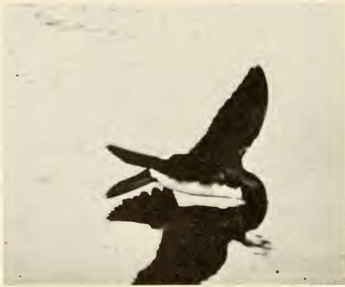
Figure 3. Chilean Swallow ( Tachycineta leucopyga ) feeding on aquatic insect larvae; note that the bird's bill and forehead are submerged.

Cliff Swallow ( Petrochelidon pyrrhonata ).—A single bird in a flock of Chilean Swallows at Rio Grande on 28-29 October 1973 is the southernmost record of the species and the first for Tierra del Fuego.